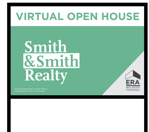
12 X 18"