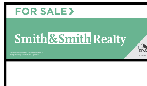
9 X 24"