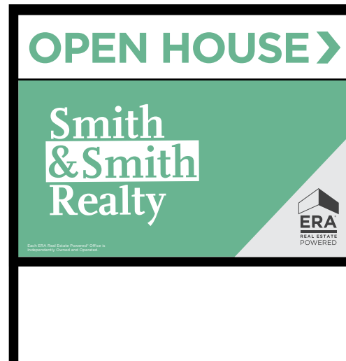
18 X 24"

To order yard signage, contact any of our approved signage vendors. Find a list of approved vendors in the ERA Select Services® area of LevERAge.era.com .